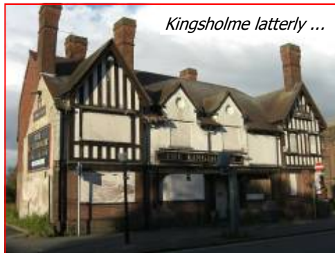
Kingsholme latterly ...