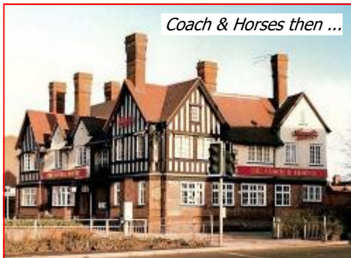
Coach & Horses then ...